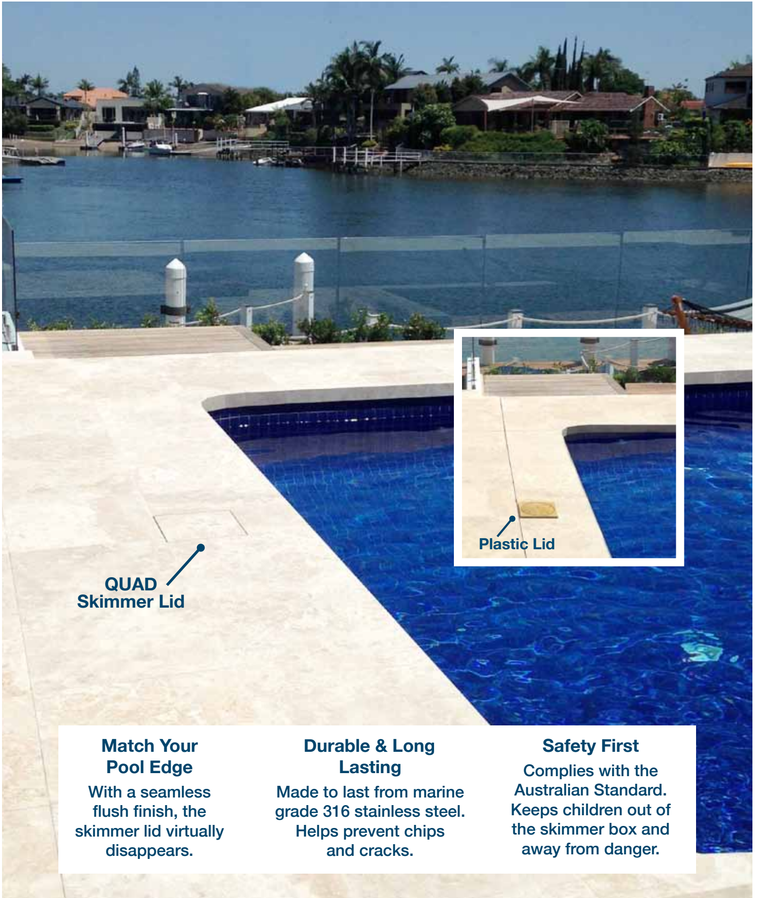
QUAD Skimmer Lid