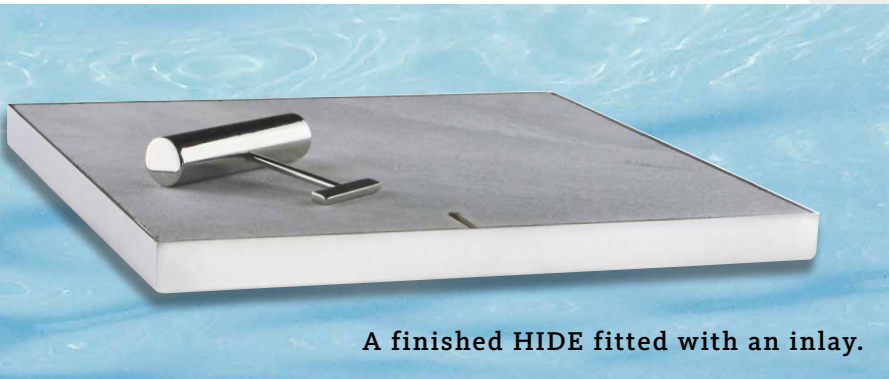
A finished HIDE fitted with an inlay.

A RANGE OF WORLD-FIRST INTEGRATED INLAY LIDS FOR POOL + LANDSCAPED AREAS.